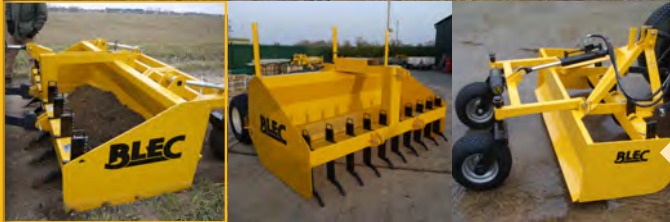
Optional swivel wheel kit.

The BLEC Box Scrapers are a low cost, easy to use landscaping tools, ideal for cultivating, levelling and clearing – a must for the contractor. Adjustable ripping tines can be raised clear of the ground or set down to rip up the ground, the 'box' effect will allow soil to be dragged forward filling in any undulations, the reverse blade will backfill or back blade very effectively. An optional wheel kit permits accurate grading. Also ideal for grading stone/gravel roadways.