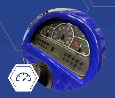
Easy to view instrument panel