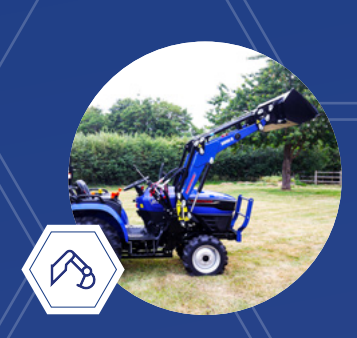
FT22 with 3000S loader