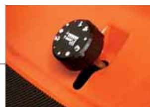
Easy Reach Cutting Height Adjustment Dial