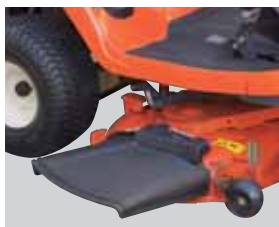
Gate open with discharge chute

In this mode, the deck discharges grass evenly and efficiently through the side of the deck, utilizing two counter-rotating blades. The flow created by these blades is where the Infinity Deck gets its name.