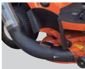
Gate open with grass catcher attached

Using the optional grass collector is now easier than ever. Its innovative design makes attaching the grass collector boot simple as well; no tools required. Just use your hands to attach and detach for your occasional collecting needs.