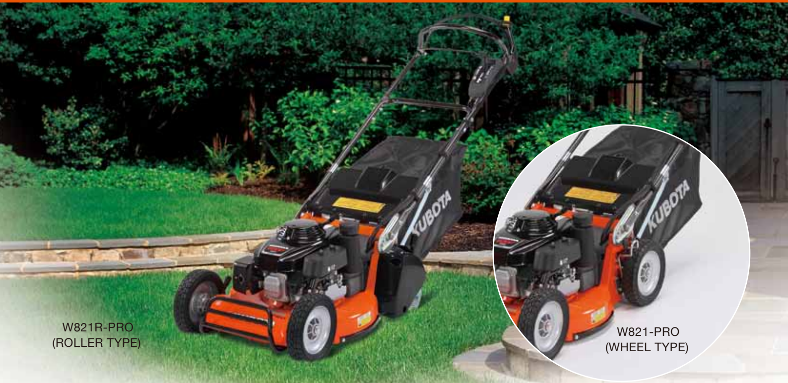
W821R-PRO (ROLLER TYPE)

From trimming well-kept lawns to mowing rough grass, a self-propelled Walk Behind Mower combining high durability with high performance — built for pros!